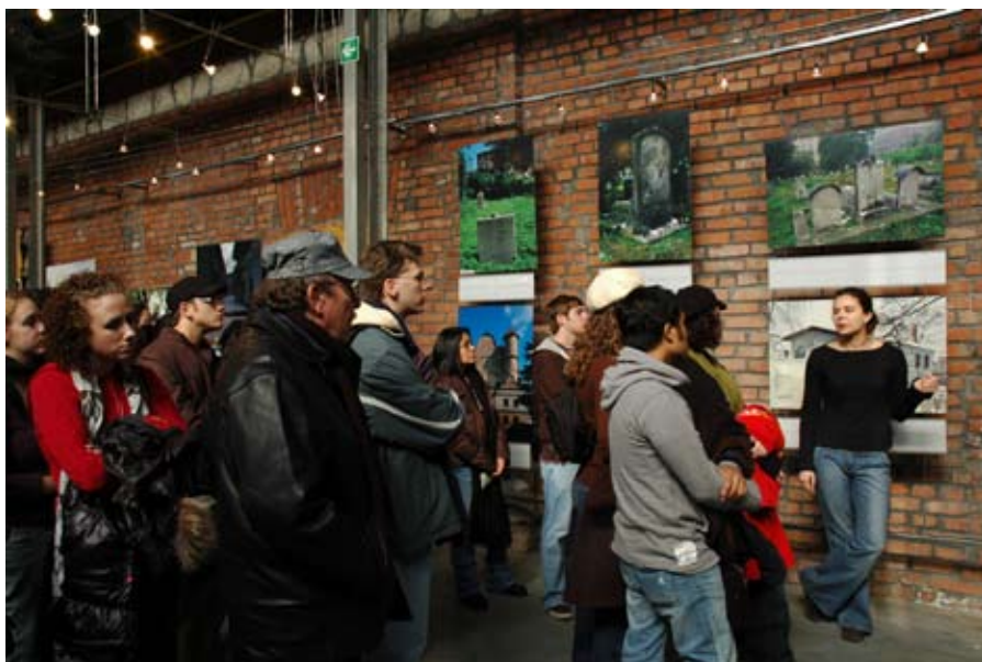
Students and faculty tour the Galicia Jewish Museum in Kazimierz, a historical district of Kraków, Poland, best known for being home to a Jewish community from the 14th century until World War II.